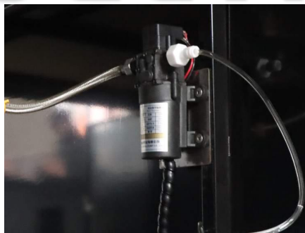
- Water Pump -