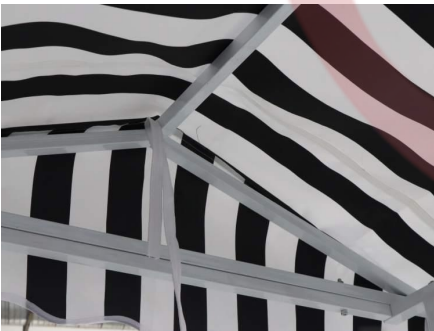
- Awning -