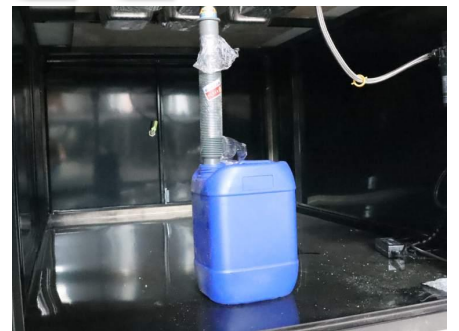
- Plumbing & Water Tanks -