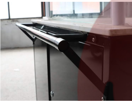
- Push Bar -