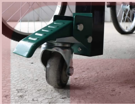
- Caster -