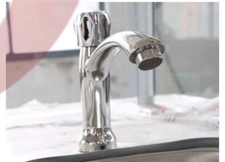
- Faucet -