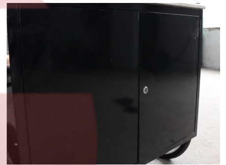
- Cabinet -