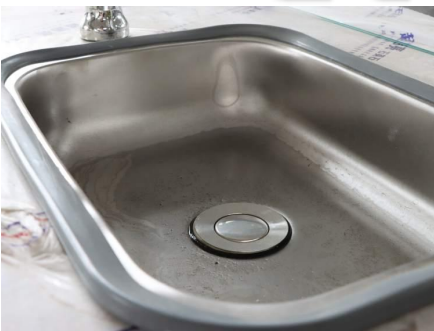
- Sink -